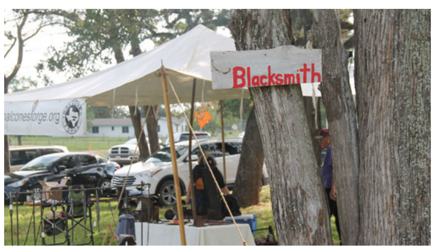
W W W . B A L C O N E S F O R G E . ORG