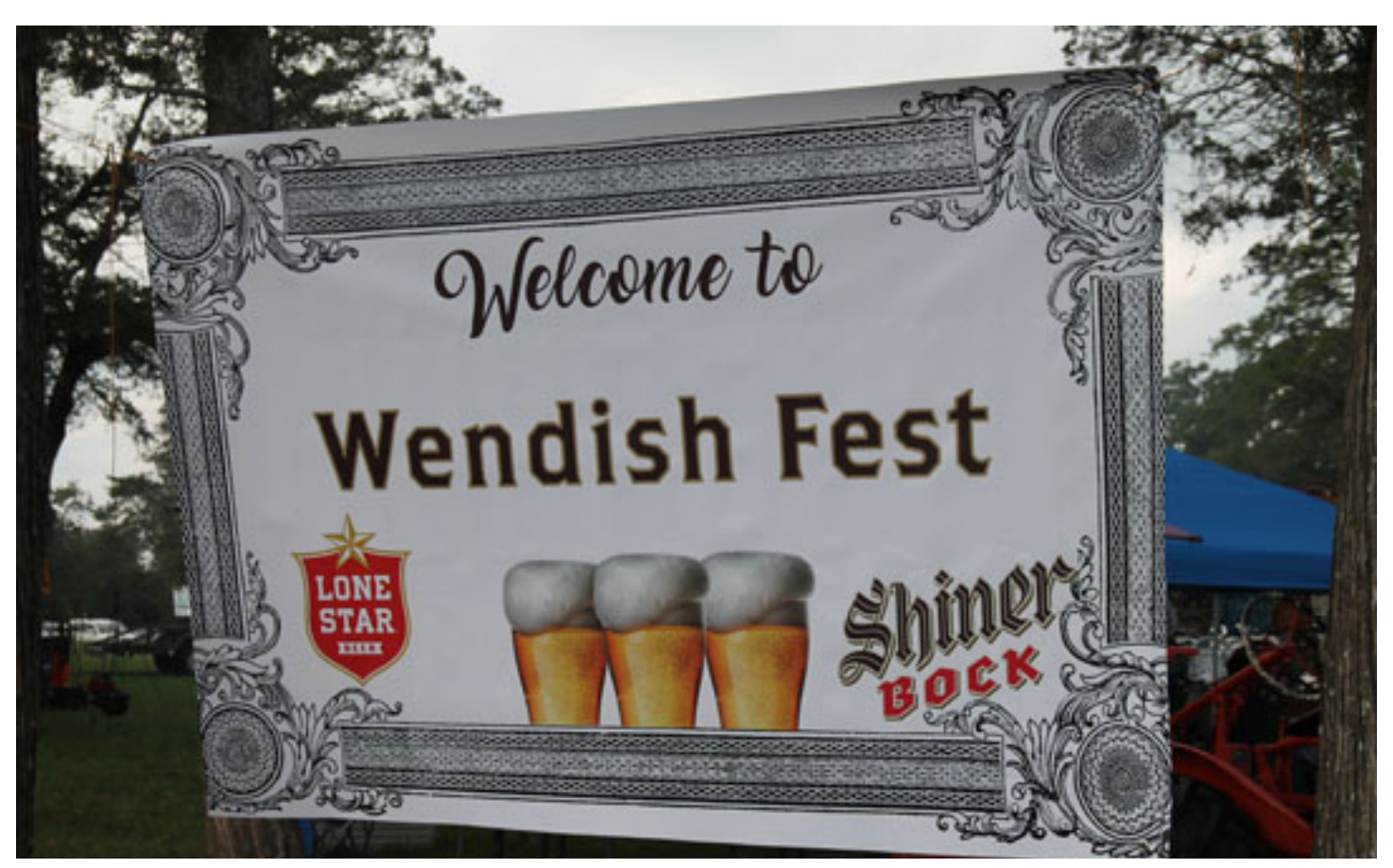
W W W . B A L C O N E S F O R G E . ORG