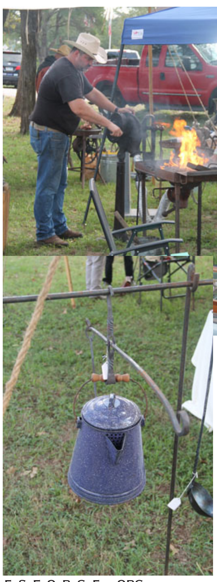
W W W . B A L C O N E S F O R G E . ORG