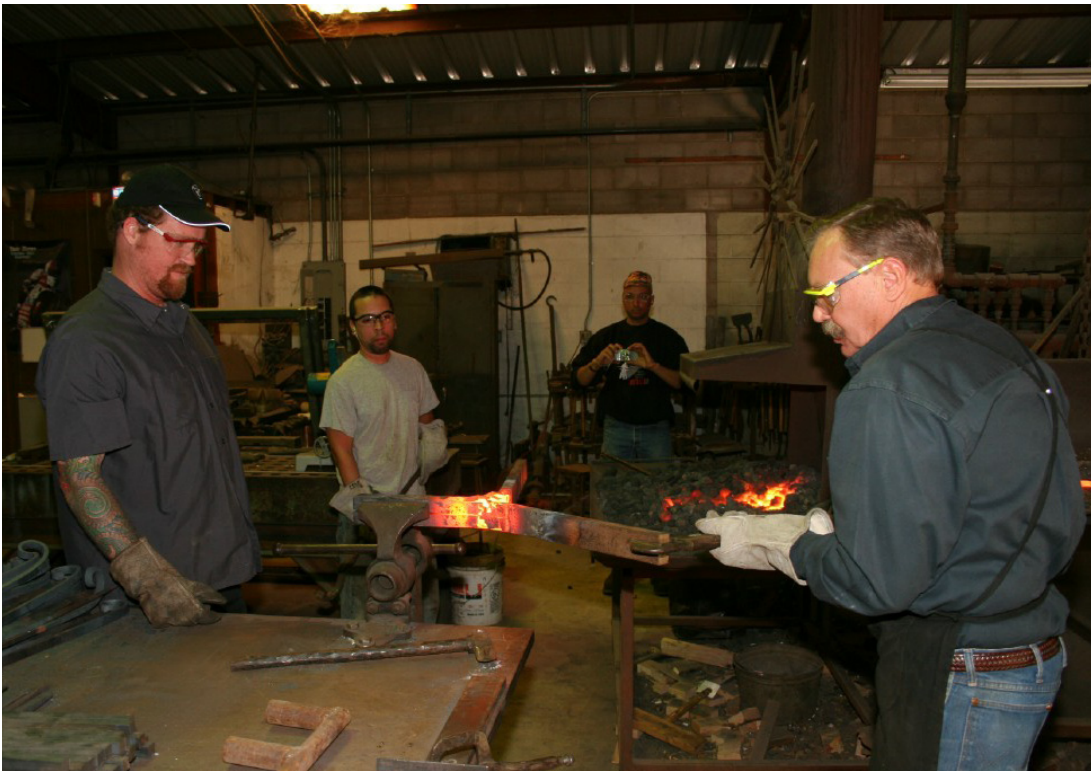
Scenes from the October meeting.