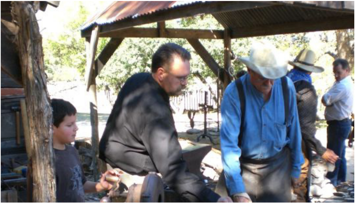
Scenes from the Wild West Days.