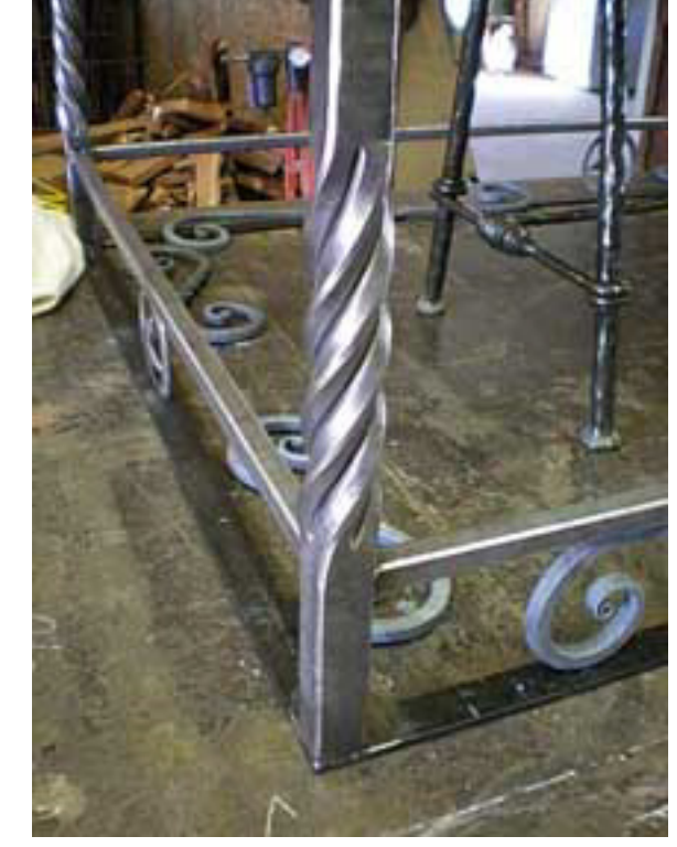
Great detail on this table!