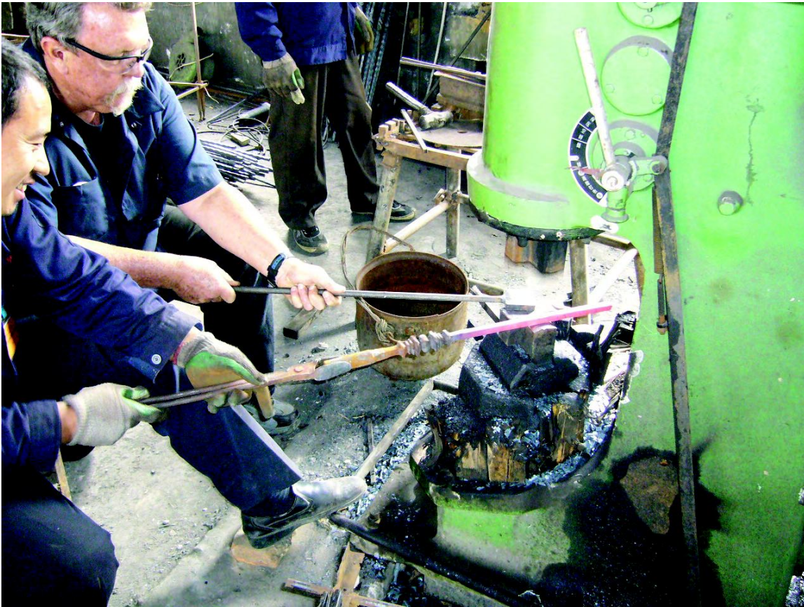
Using a kiss block on the combination die

The factory also had RF induction heaters for part of their stamping operation as well as automatic twisters and some 50 ton hydraulic presses. Labor is certainly cheap with an experienced smith making about $1000 a year on a piece part basis. I think the worst job I saw in the factory was the poor guy sitting on a low stool which was about a foot off the ground in front of a chop saw with a huge pile of bar stock behind him cutting it up into 18 inch lengths, all day long he ran that chop saw, seemed pretty happy though, always had a smile on his face and a happy hello. The guys working in the galvanizing plant weren't quite so happy, not a nice place to work, for sure.