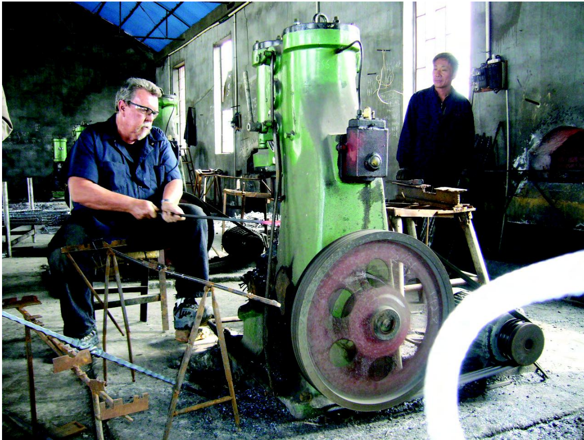
Smokey on the hammer, forged baluster on length sizing rack in foreground

The hammer of choice is the Angyang (or local equivalent) hammer in the 33lb, 88 lb and 165 lb categories. Additionally the mom and pop subcontractors use the 88 lb Angyang.. The ability of the smiths to hand forge to dimensions of \pm 0.2\text{mm} ( yep that's right and I measured plenty of them) is really impressive, given the complex shape demands and length requirements. There is great uniformity of tooling ( hammers and forges) both within the main company and among their subcontractors. Same hammers, same coal, same forges, same chimneys, same combination hammer dies, no variation!