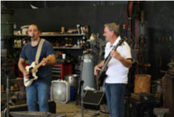
The bands entertains at lunch.