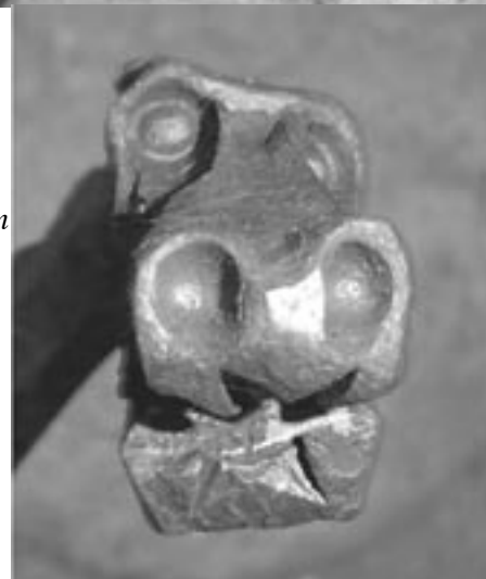
Right, head on

Randy also taught the Sunday morning bonus class. Where he helped 10 lucky members make a colonial meat fork.