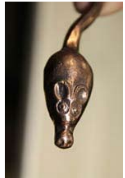
A bronze mouse and a steel fish with a glass eye!