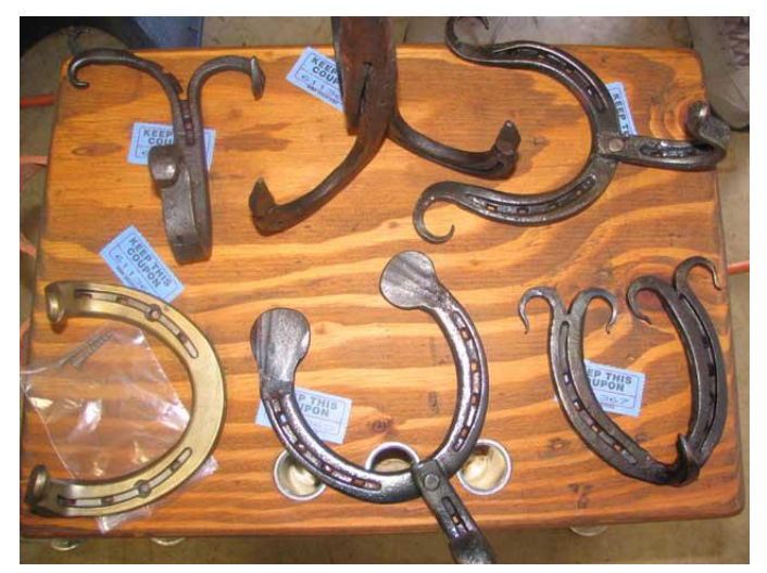
Trade Items from the June Meeting.

Remember the auctions at our demos are what really pays the costs of this organization. Our dues alone would barely cover the cost of the newsletter so it is YOUR generous donations to the auction that keep the organization going strong.