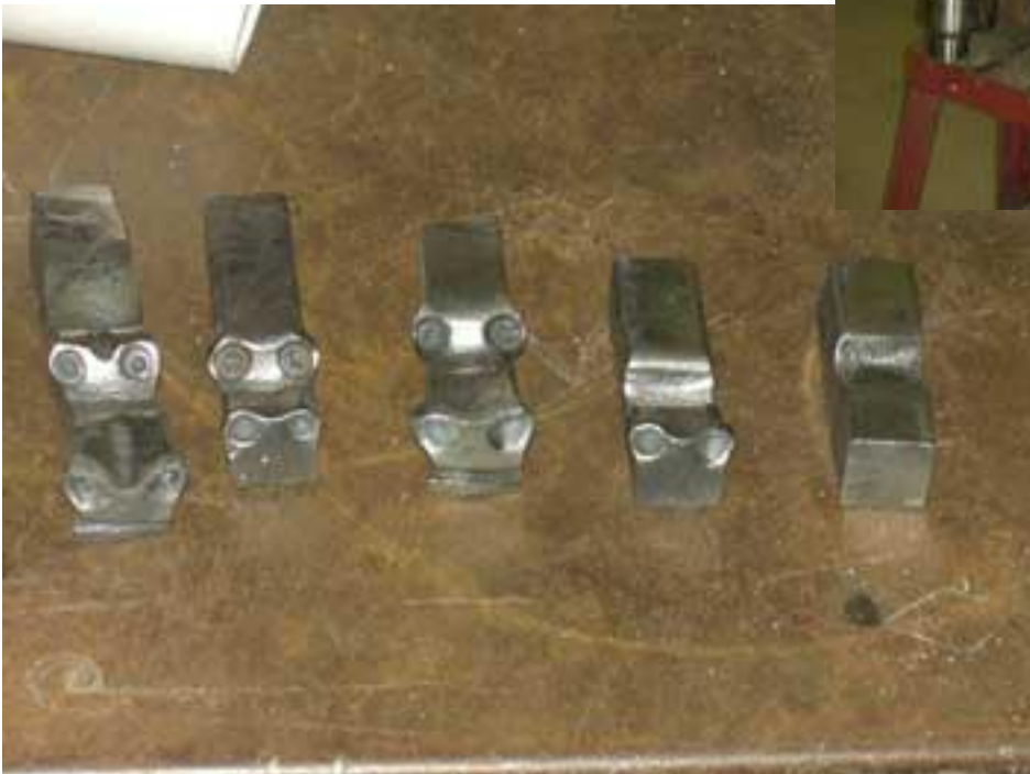
Scenes from the January meeting.