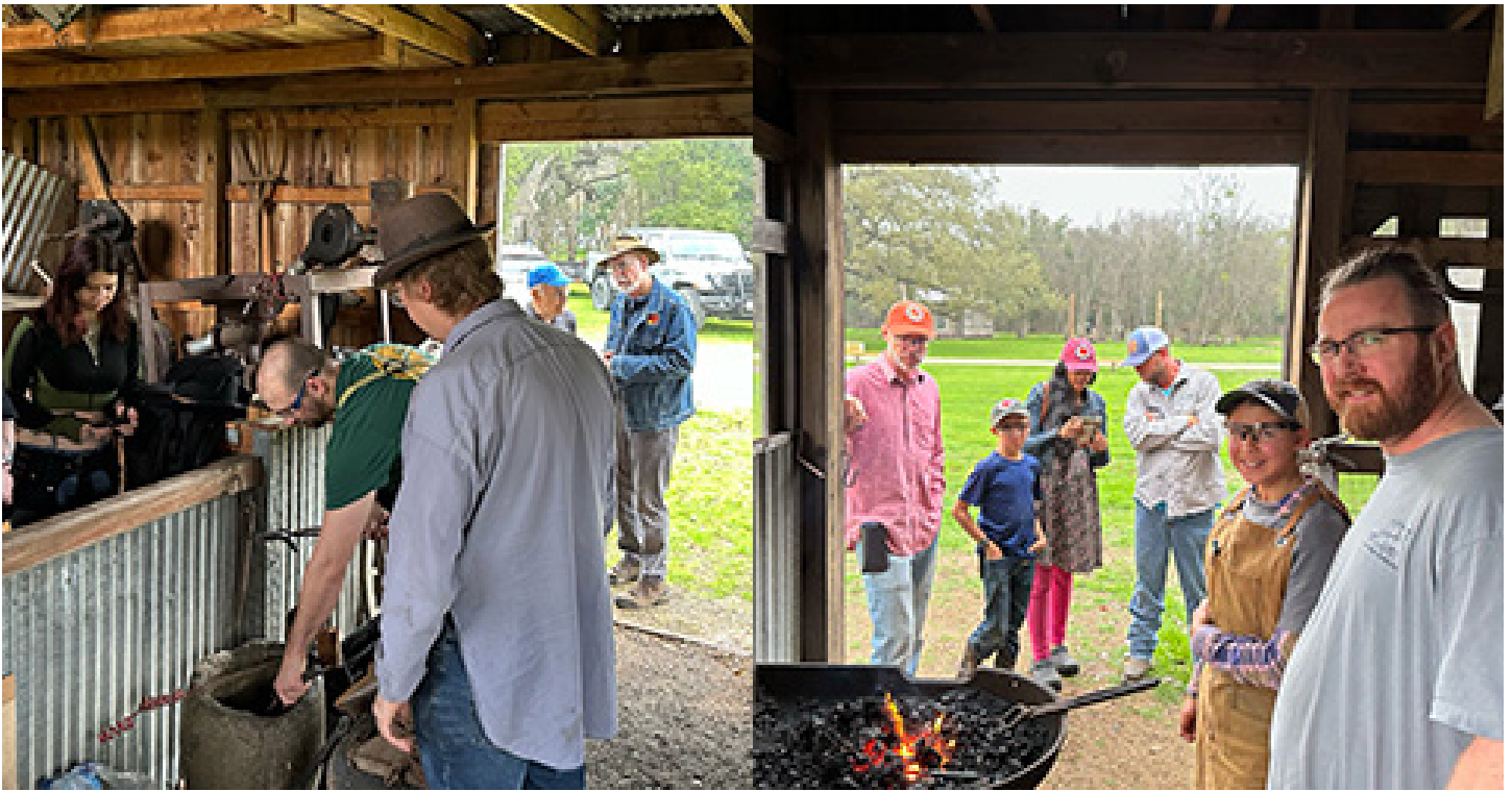
Lots of folks enjoying the demonstrations at the February meeting.