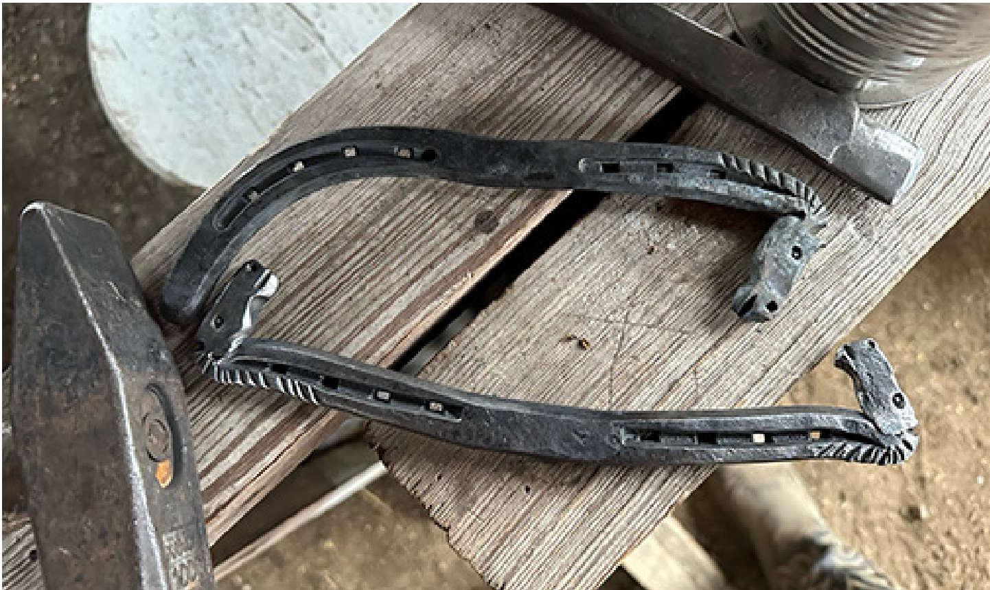
Demo pieces and trade items from February Meeting.