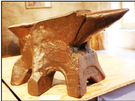
←Five-legged farrier's anvil, central France, 17th century. Iron and Railway Museum, Vallorbe, 2012 expo. Wgt: ~130kg.