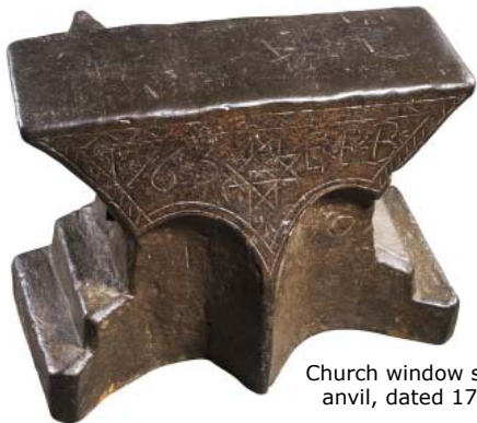
Church window style anvil, dated 1763