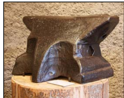
Anvil, forged, 17th century, Canton of Vaud, Switzerland. Iron and Railway Museum, Vallorbe, 2012 expo. Wgt: ~90kg.