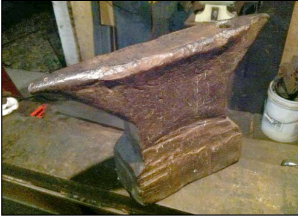
Medieval Continental Anvil, Europe, 15th or 16th century.