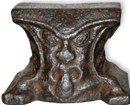
Ancient German Art anvil with face.

←National Museum of Transylvanian History 2nd century CE. Weight - 50 kg