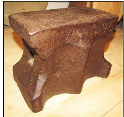
Classic hornless church window style anvil, 1796, about 50-60kg,