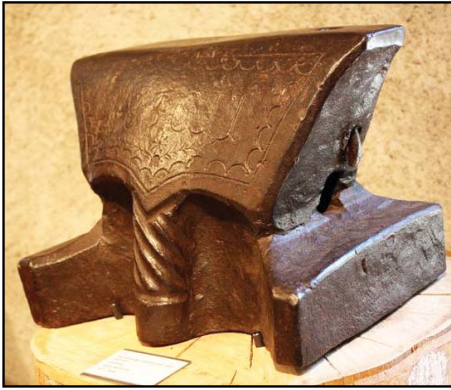
Originally from the Canton of Grisons in Switzerland. Dated from 1811. Weight: 96 kg.