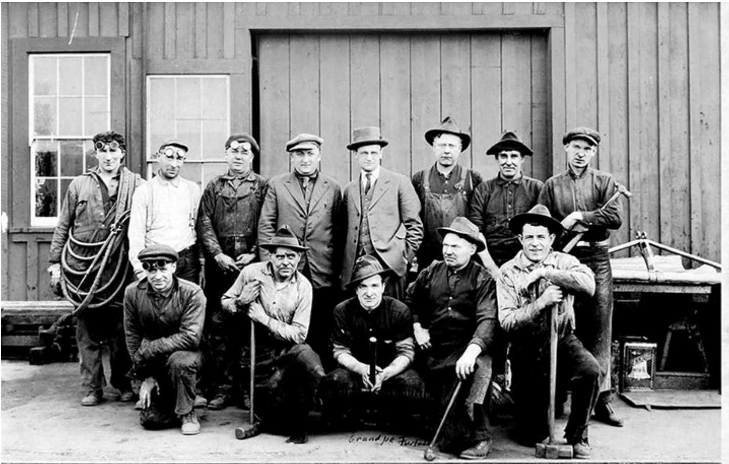
Was this really at last month's meeting?