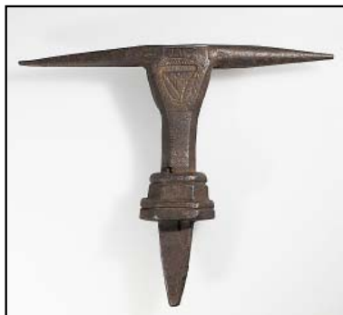
Armor Anvil 16th Century