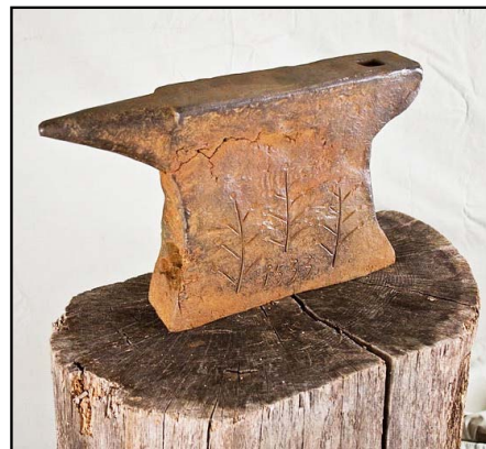
"Tree Anvil" dated 1533