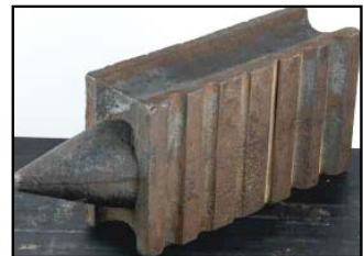
Anvil Museum Collection - Swage Anvil, American Colonial