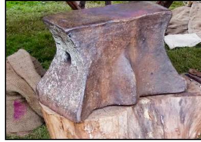
At Herstmonceux Castle, Herstmonceux, East Sussex, England, 16th century