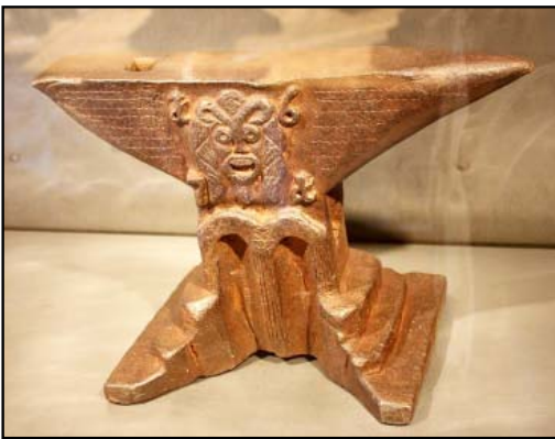
Anvil for small ironwork originating in the region of Styria in Austria. Dated 1671. Weight: about 20 kg.