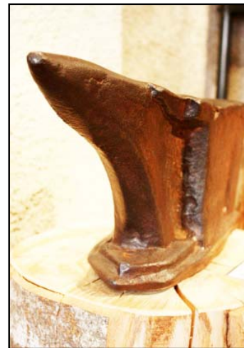
15th-16th century, France. Iron and Railway Museum, Vallorbe