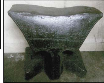
1833, Northern Bohemia, about 100 kg