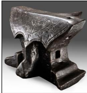
Anvil, carved and engraved iron, France dated 1793