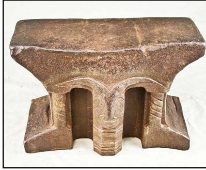
Anvil Museum Collection - 1802 - Stamped CK, 5th foot with church windows