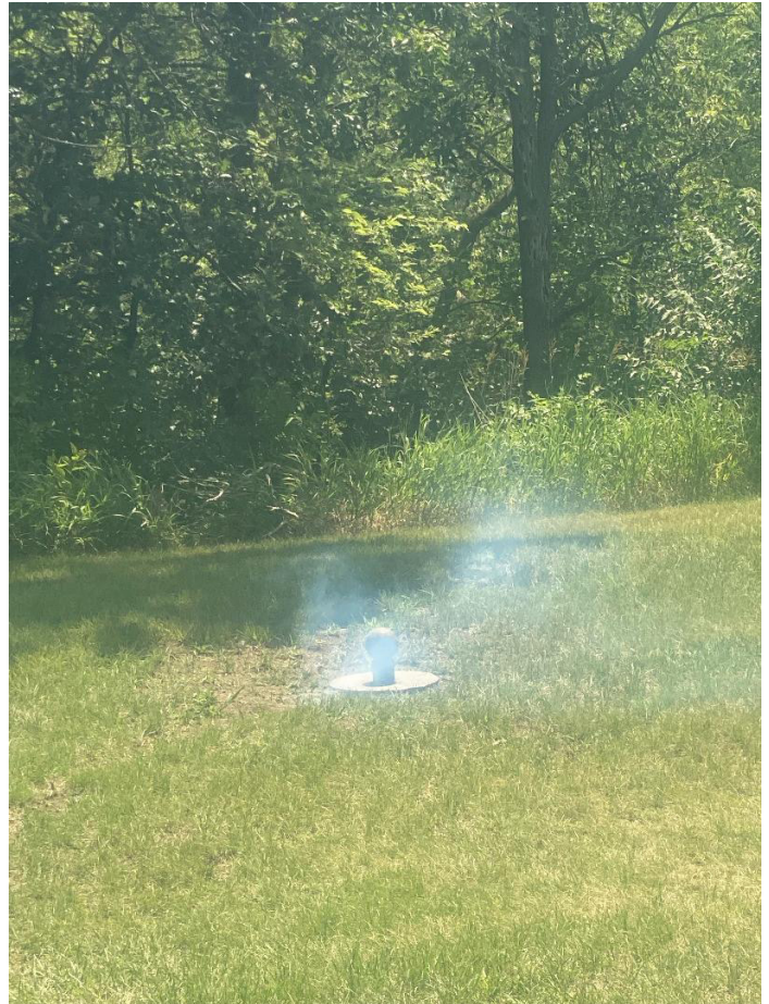
Not quite an anvil shoot but still pretty cool!