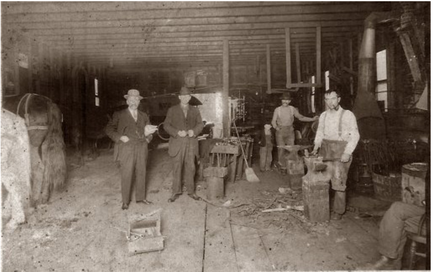
Somebody said this is from the July meeting. It doesn't look like the temperature was that hot!