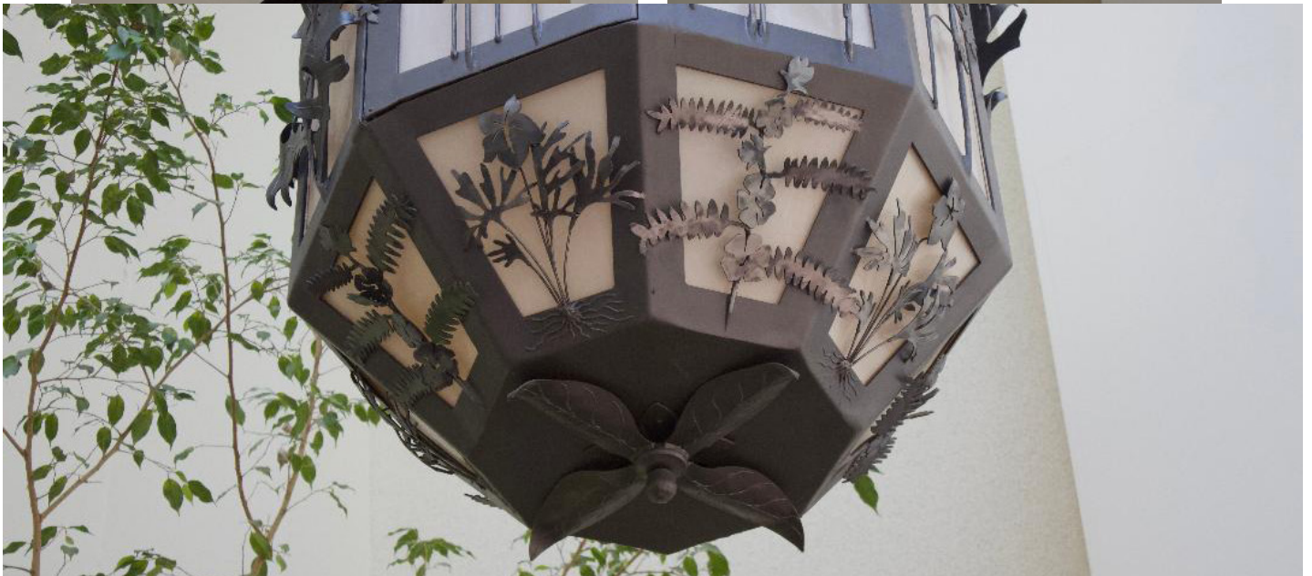
Photos of the chandeliers mentioned in the Presidents message.

The Balcones Forge Newsletter is written by the editor except as noted. Balcones Forge, its officers, members, contributors, editors and writers specifically disclaim any responsibility, or liability for any damage, or injury as a result of the use of any information published in the newsletter or demonstrated at a meeting or conference. Every effort is made to insure the accuracy and safety of information provided but the use by our members and readers of any information published herein or provided at meetings is solely at the user's own risk.